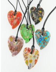
$250 Wholesale Murano Glass Heart Necklace