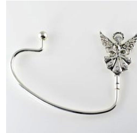
$1,000 Wholesale Angel Purse Holder