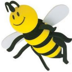
$450 Wholesale Believer Car Antenna Ball