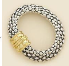
$600 Wholesale Silver Yurmanesque Magnetic Bracelet